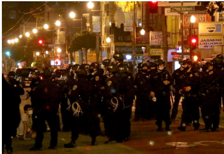
Some of the police and one arrestee.