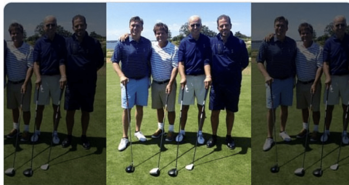
Joe, Hunter Biden seen golfing with Ukraine gas company exec back in 2014, ph... A photo obtained by Fox News' "Tucker Carlson Tonight" shows former Vice President Joe Biden and his son Hunter Biden golfing in the Hamptons with Dev...

Joe, Hunter Biden seen golfing with Ukraine gas company exec back in 2014, photo shows | Fox News