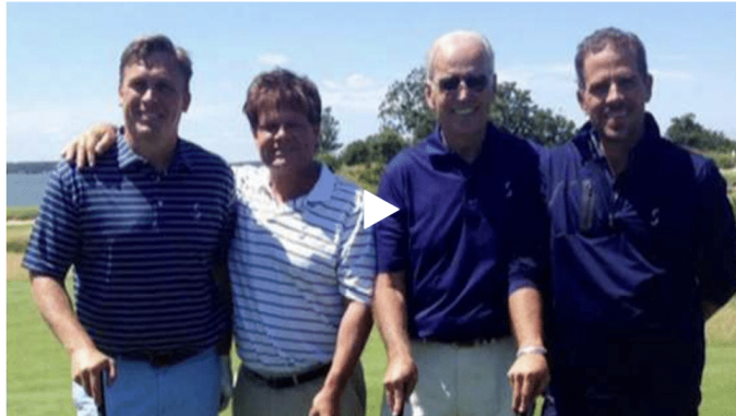
Tucker Carlson Tonight obtains photo of Joe Biden golfing with his son and Ukrainian business partner