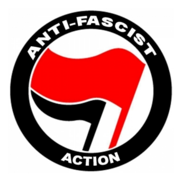
Antifa logo. Yes, I've even had this as a sticker on my laptop. So subversive! Much Terrorism.

except that you don't want to be identified while fighting with the police, and you're there to throwdown. Plenty of Black Bloc attend protests just because they want to fight someone and fighting the police is safe in a weird way. It's very exciting, you're probably going to lose, you might help someone, and the police aren't really going to get hurt. Also you're probably going to engage is some light property damage, especially if the police take too long to form a line for you to fight. For a few of the Black Bloc I've met, it's definitely the healthiest way they have to get out an excess of aggressive energy. Possibly they shouldn't be like that, but they tend to be in the demographic that doesn't have health insurance so I figure it's a reasonable substitute for mental healthcare, which this country isn't going to give them.