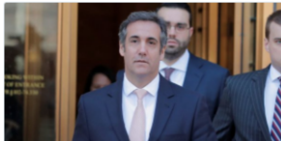
Michael Cohen Adviser Deals Major Blow To The Steele Dossier dailycaller.com

NEW: Michael Cohen did NOT go to Prague, as the Steele dossier claims, says Lanny Davis. A huge blow for the collusion narrative. dailycaller.com/2018/12/17/mic... @DailyCaller