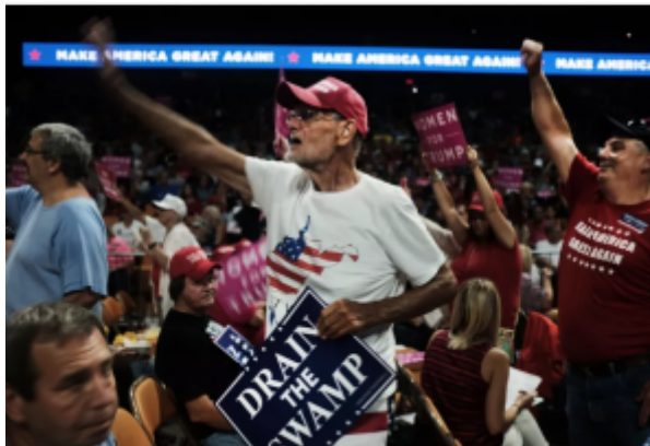
President Donald Trump's supporters chant "lock her up" while ignoring that Michael Cohen and Paul Manafort face prison time.

snippets of in the Alex Van der Zwaan plea: Manafort's use of Skadden Arps to whitewash Yanukovich's prosecution of Yulia Tymoshenko.