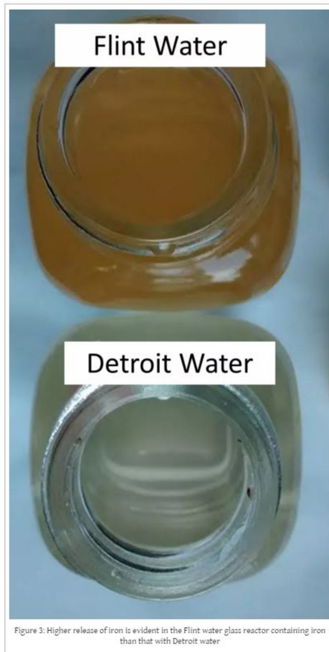
Figure 3: Higher release of iron is evident in the Flint water glass reactor containing iron than that with Detroit water

Flint water that has been in the presence of iron for five days takes on a reddish-orange cast while Detroit water does not. Image is Figure 3 found at http://flintwaterstudy.org/2015/08/why-is-it-possible-that-flint-river-water-cannot-be-treated-to-meet-federal-standards/ by Dr. Marc A. Ewards and Siddhartha Roy.